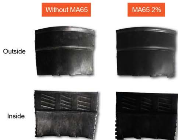
Fig 1 : Comparing silver steak of finished product with and without Elastoflex ® MA65 2%